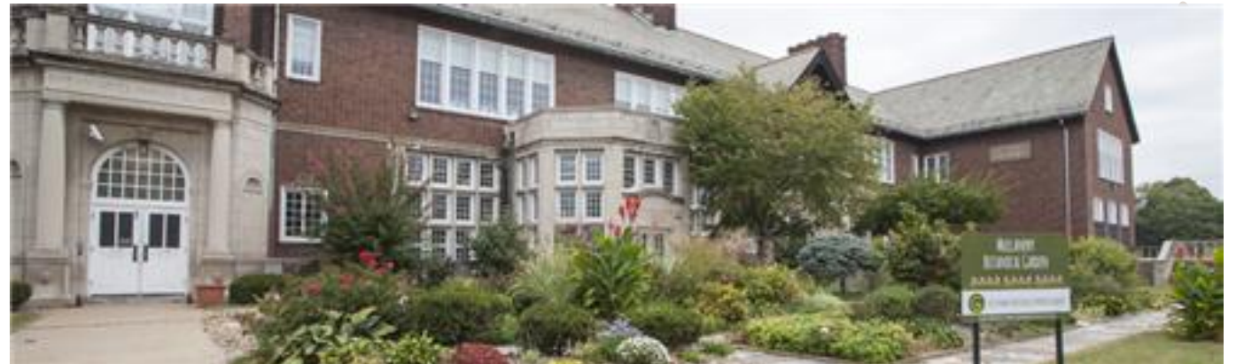
Mullanphy Elementary School 4221 Shaw Ave St. Louis, MO 63110